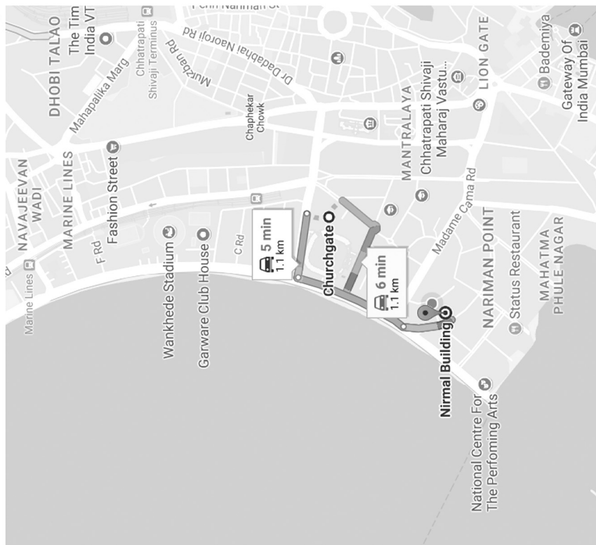
Route from Churchgate Railway Station